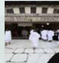
Al Salam Gate