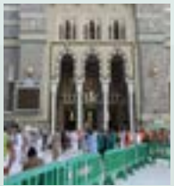
King Fahad Gate