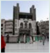
King Abdulaziz Gate