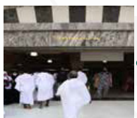
Al Salam Gate