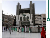
King Abdulaziz Gate